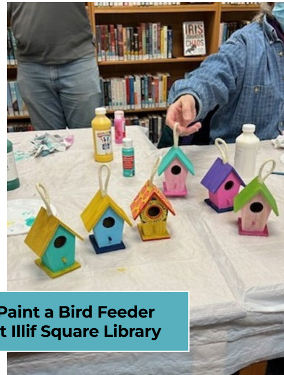
Paint a Bird Feeder at Illif Square Library