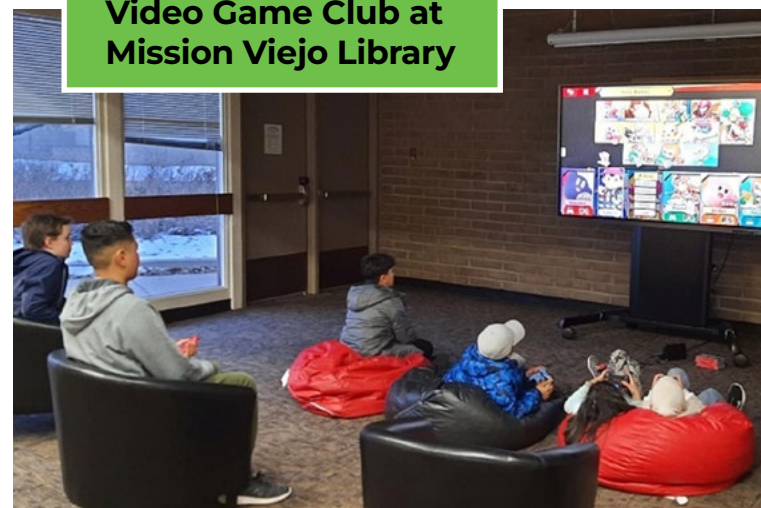
Video Game Club at Mission Viejo Library