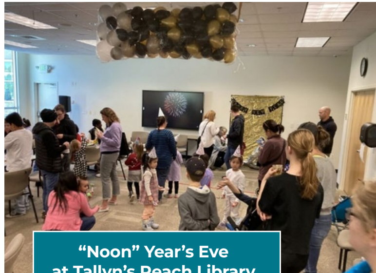
"Noon" Year's Eve at Tallyn's Reach Library