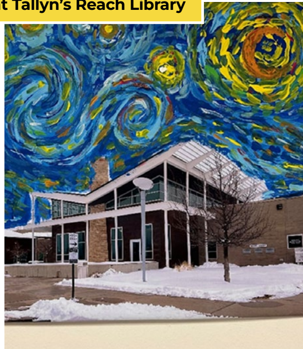
Paint Like a Pro at Tallyn's Reach Library